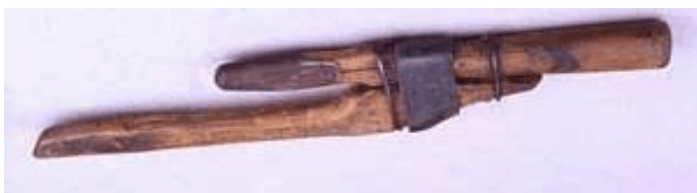
The dreaded Wouff Hong.

http://www.arrl.org/tis/info/history.html