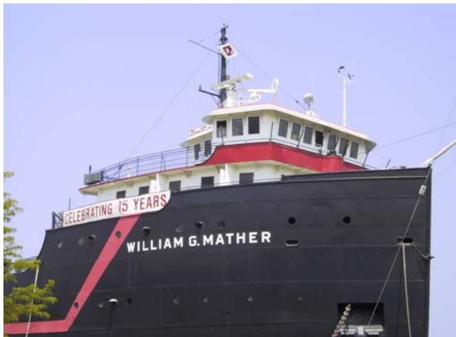
William G. Mather

Anyone interested in helping please contact me ASAP. I will be contacting the members of the W.G. Mather committee to arrange the best dates for our work parties.