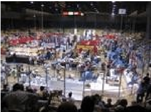
In the main arena on Sunday