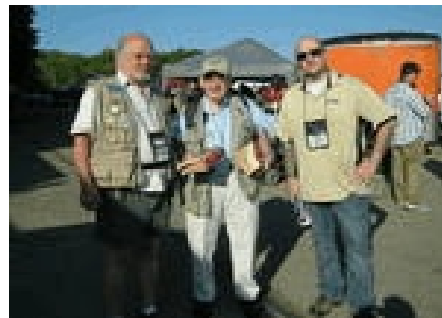
WB8N, W3RP & N8MOX somewhere in the flea market