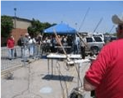
Amsat demonstration in flea market