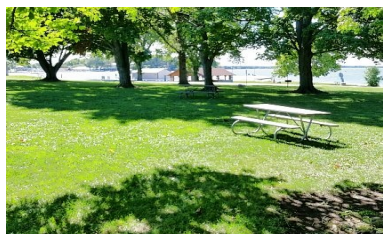
Catawba State Park

The event is a short 8 hour event. The event will be on the calendar for a 2016 activity as it is just another time to "Get on the Air"!!