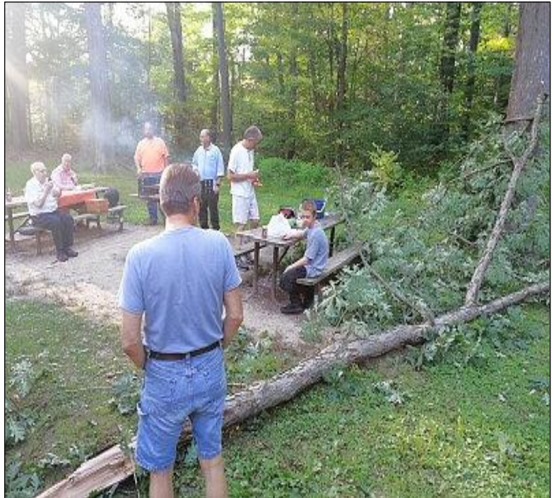
The July picnic meeting got exciting when a tree limb snapped and shook the ground when it landed.

AUG 1 N8OWS AUG 8 K8KR AUG 15 KD8ACO AUG 22 WT8O AUG 29 AC8NW